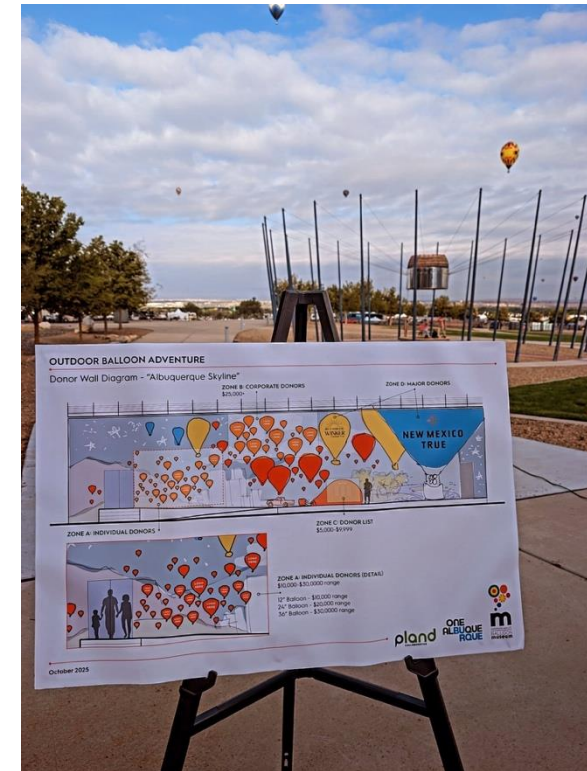
AAIB Museum Outdoor Balloon Adventure