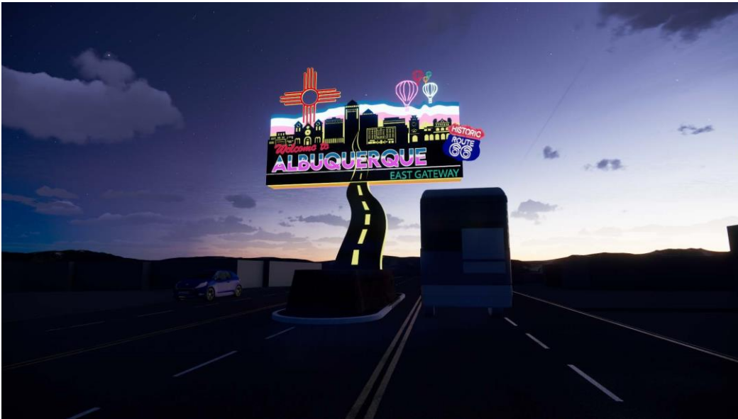
Route 66 East Gateway Neon Sign - Albuquerque

This is a competitive grant that supports the long-term destination development and rejuvenation of community-based, sustainable tourism infrastructure projects across New Mexico. The program is a result of NMTD collaborating with the seven Councils of Government in New Mexico.